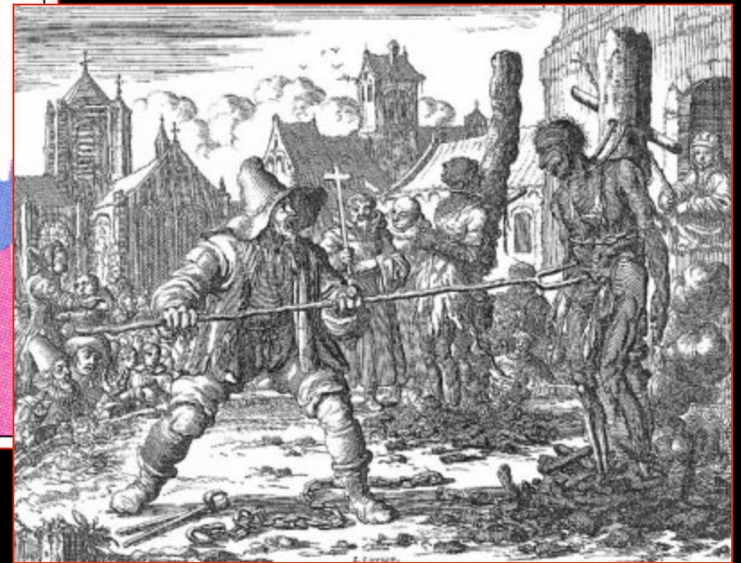
Dutch persecution of Anabaptists (Mennonites)